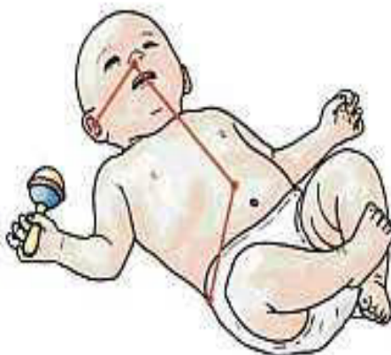
Figure 1. Measuring TPT length for an infant (<1year) Measure from the ear to the nose to the midpoint between the xiphisternum and umbilicus, continuing to the right iliac crest for trans-pyloric length.